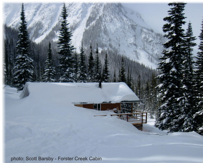
Forster Creek Cabin